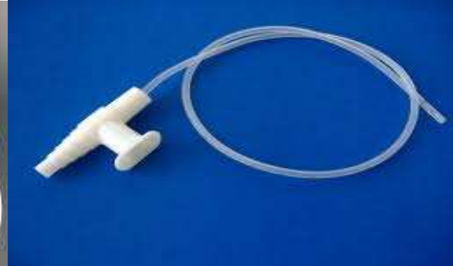
4 Types of Connector